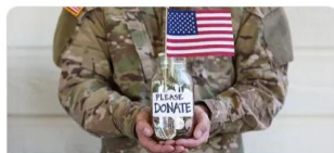
General Chapter Donations

We are excited to announce a positive change to how you can make online payments for future dues, lunches, and other chapter events! To streamline our payment process, we will be transitioning from PayPal to Cheddar Up for all future online transactions. This is the same platform already adopted by other MOAA