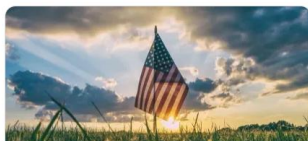
2025 MEMBERSHIP DUES